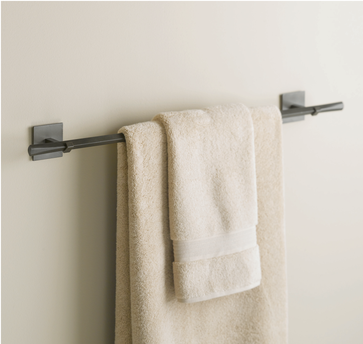
84-3012 BEACON HALL TOWEL HOLDER